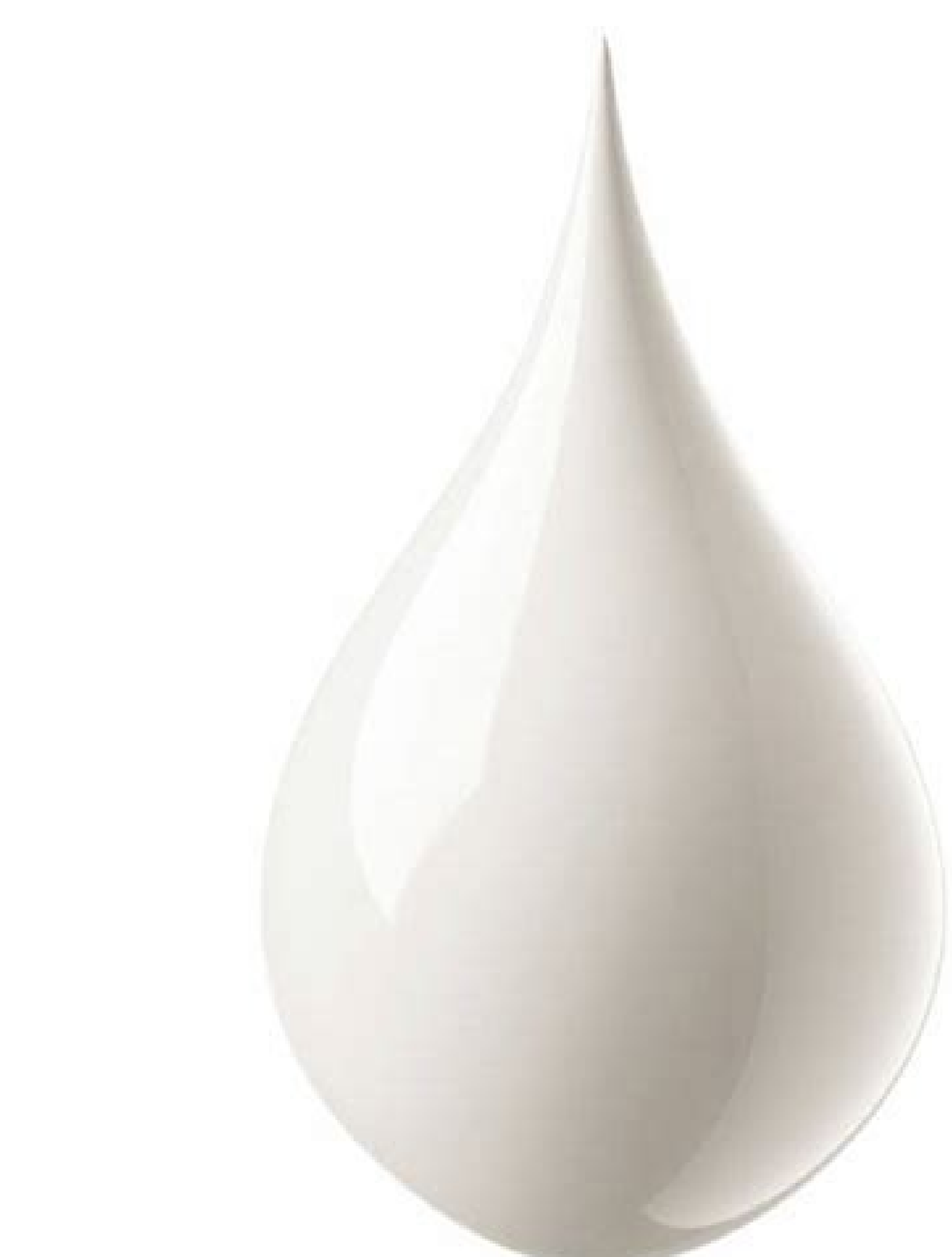
Ceramide complex clrtm k. Ceramide complex clr inci.